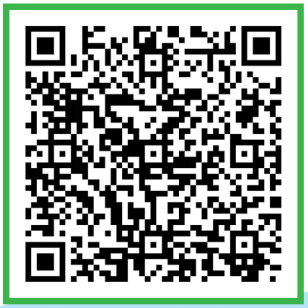
Scan code to download this fact sheet and visit our library of Line 5 resources.

Individuals, families, organizations, communities, governments, tribes, businesses, and faith leaders are working together to shut down Line 5 before it's too late.