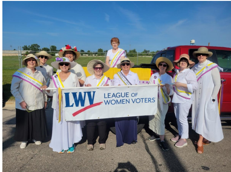
Members of the League of Women Voters of Lenawee County participated in the Tecumseh Bicentennial Parade

The LWV of Mount Pleasant Area held its first "Coffee Klatch," on July 9 th . A Coffee Klatch is a social gathering for informal conversation in which coffee is served. For LWV-MPA this event is an opportunity to chat about League news and catch up with fellow members while also providing an option to bring potential new members.